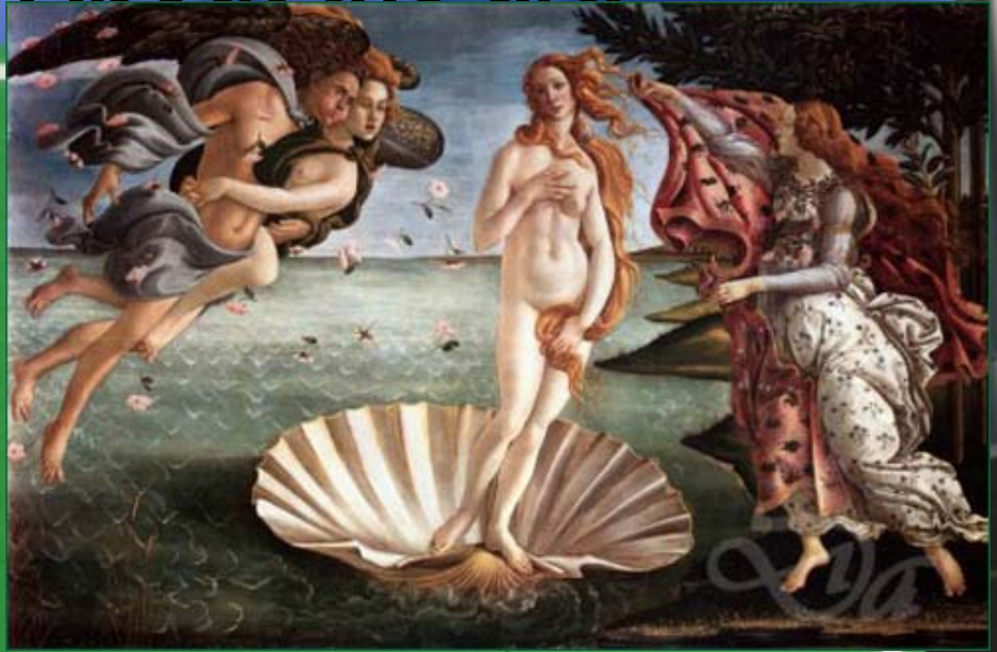
The Birth of Venus by Botticelli

Can you see the story in this painting more easily than in the sculpture?