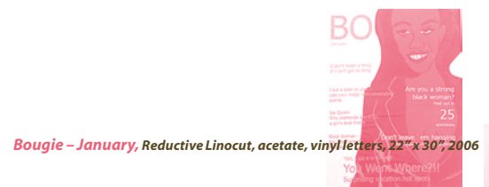
Bougie - January, Reductive Linocut, acetate, vinyl letters, 22" x 30", 2006