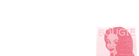
Bougie - April, Reductive Linocut, acetate, vinyl letters, 22" x 30", 2007