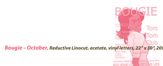
Bougie - May, Reductive Linocut, acetate, vinyl letters, 22" x 30", 2007