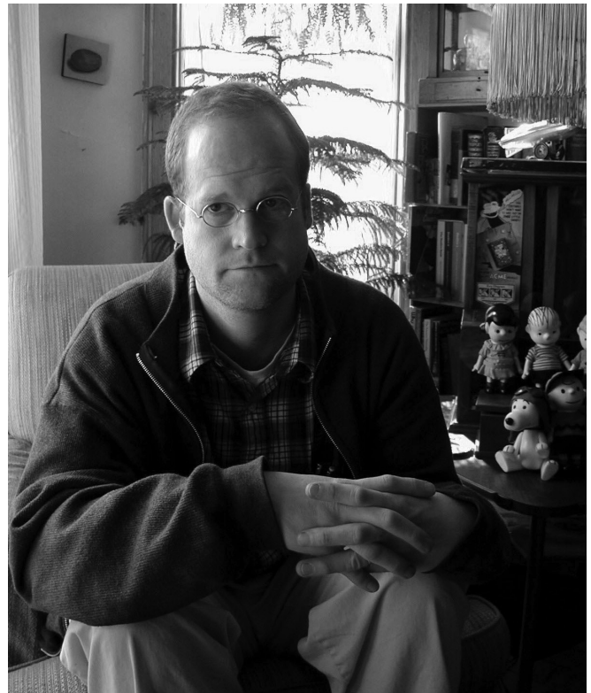
(Above) Chris Ware in Chicago; (Below) Chris Ware self-portrait

I've been working on a long comic strip story for the past six years set in Omaha, which is where I was born and was raised to the age 16. Like anyone who had a relatively happy childhood, the story is loosely autobiographical, and is set partly in one day in 1975 (though one chapter also takes place largely in the 1950s, and a later chapter covers the years 1958 through the present) and in it the characters and people and family members sort of freely intermix in a way that I guess is similar to what happens in one's dreams (i.e., "I dreamed last night that I was married to my second grade teacher, except that she wasn't my teacher, she was my grandfather and we were on a boat playing checkers," etc.). Along these lines, I've tried to use settings that are so familiar to me I could close my eyes and draw detailed maps of them, such as a school I attended and a house up the street from where I grew up, as well as a few downtown build-